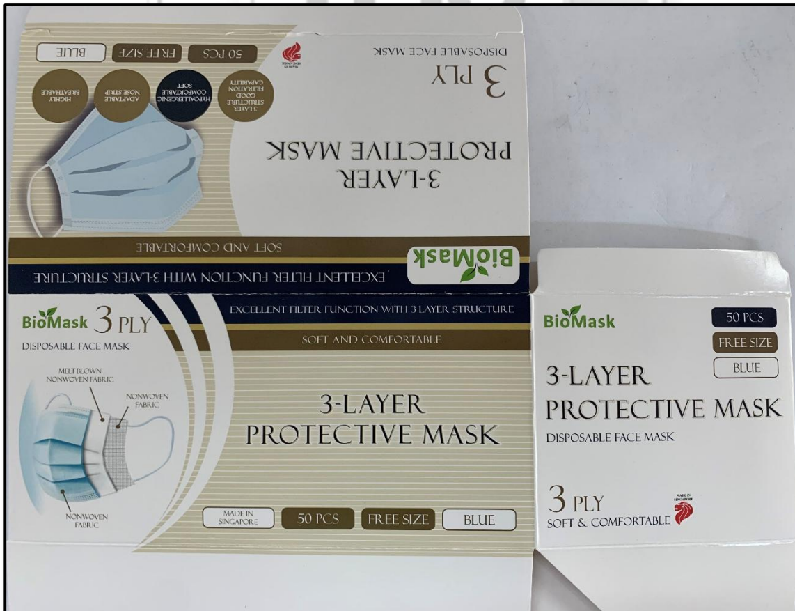
Figure 2. "BioMask 3-Layer Protective Mask" sample packaging as received